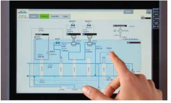
User-friendly – fully automated.