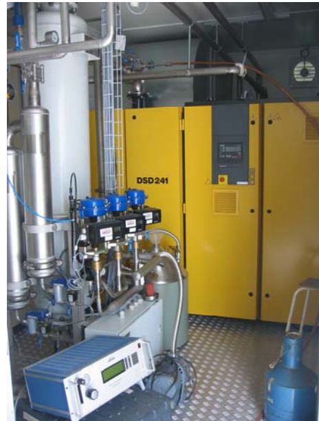
GHe Compressor with ORS