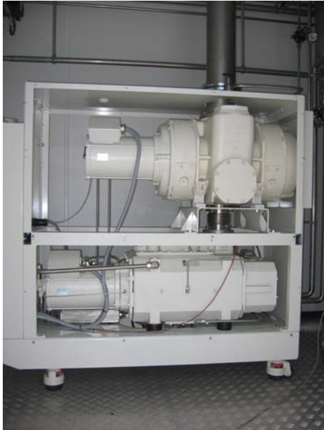
Process vacuum pump